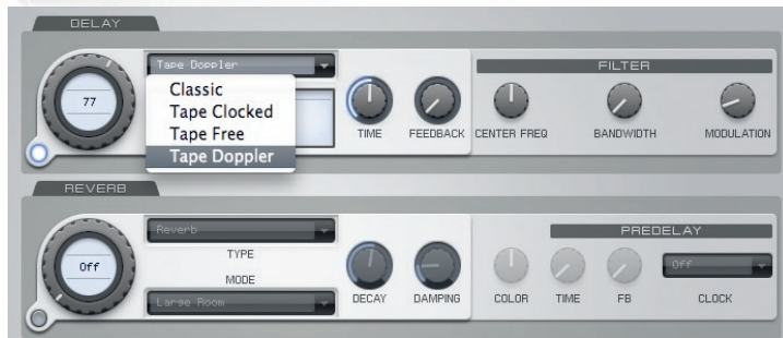
The new FX interface in the Virus Control software

effects section, which has now been split in into FX1 and FX2 pages within Virus Control. The new effects are a wider set of Tape Delays, significant revisions to the Distortion plug-in (see the Distort Me Good box) and an all-new Frequency Shifter. The Tape Delay revisions provide three new variants –