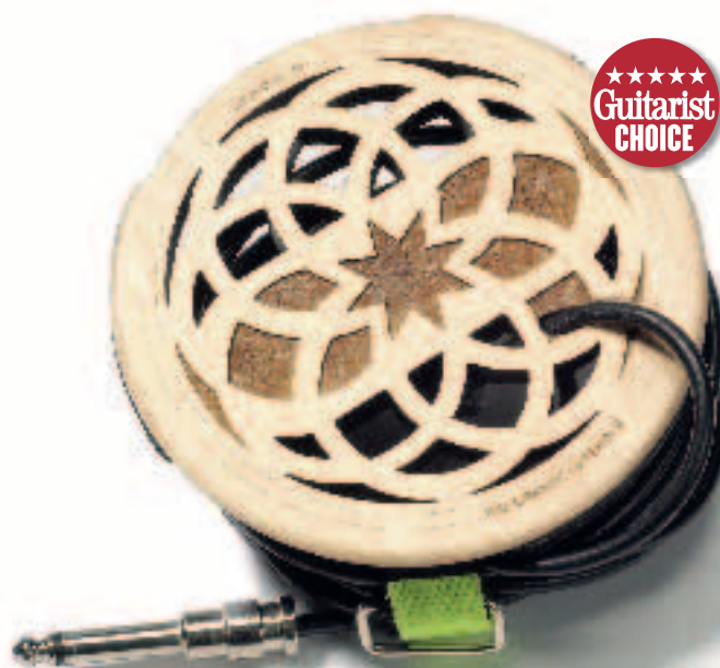
Lute Hole and Rio Grande: a marriage made in guitar heaven

Two beautifully crafted products in an easy-fit soundhole pickup by Benji Bartlett