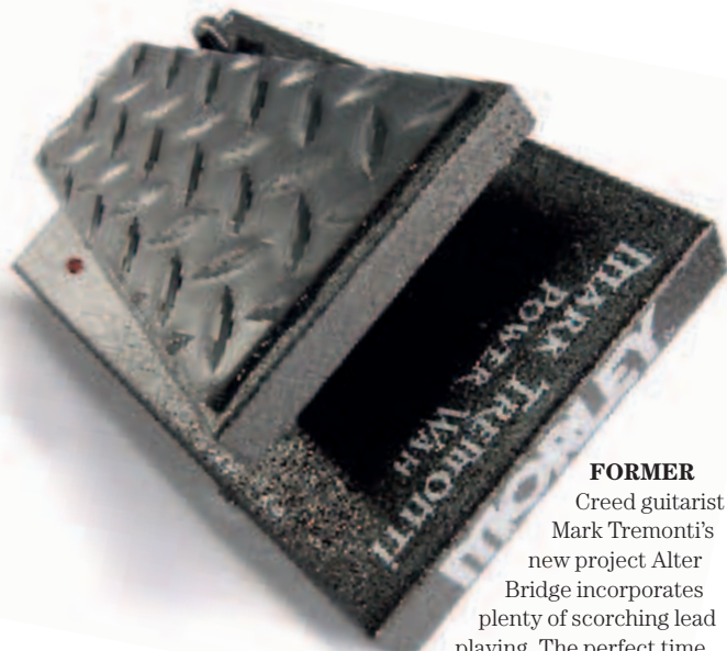
Tremonti's treasure: for scorching lead sound, the Power Wah is 'it'

A durable new wah with a penchant for rock by Chris Vinnicombe