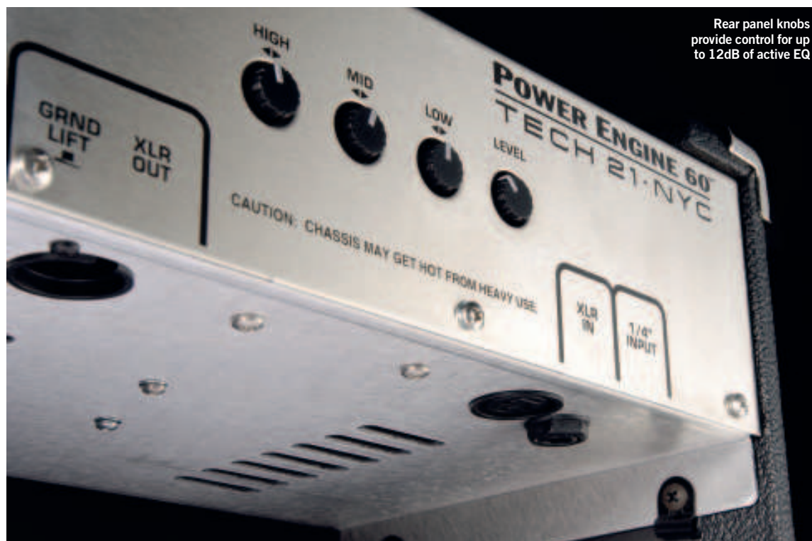
Rear panel knobs provide control for up to 12dB of active EQ

The only direct combo designed to do the same job as the PW60 that we could find is the Atomic Reactor 112 which we reviewed back in Guitarist 262. This is an 18-watt valve amp with a 12-inch speaker that features a docking bay into which you can slot a POD or similar. As an alternative to a combo, a rack-mounted power amp could be combined with speaker cabs, although price and the portability factor are probably less attractive. Marshall, for instance, do stereo valve power amps at 20, 50 and 100 watts. A small PA could possibly do the job although you wouldn't be getting the authentic 12-inch Celestion speaker sound and would have to rely on your amp sim's speaker emulation. Alternatively, if you want a combo with a varied range of different amp sounds built in, there's the Trademark 60 or the Flextone 3.