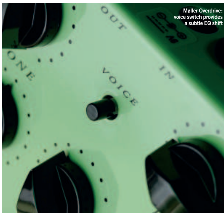
Møller Overdrive: voice switch provides a subtle EQ shift

The first of our pastel-coloured units is the Møller, an overdrive stompbox with an additional footswitchable 20db boost. While its powder-coated aluminium housing finished in fifties-style 'surf' green is certainly elegant, there are no worries regarding the unit's physical sturdiness. The twin footswitches feel positive and dependable underfoot, while the action