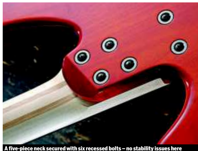
A five-piece neck secured with six recessed bolts – no stability issues here

Having two identical Alnico-loaded pickups and a three-band active EQ means there's a huge variety of sound options available. It naturally plays