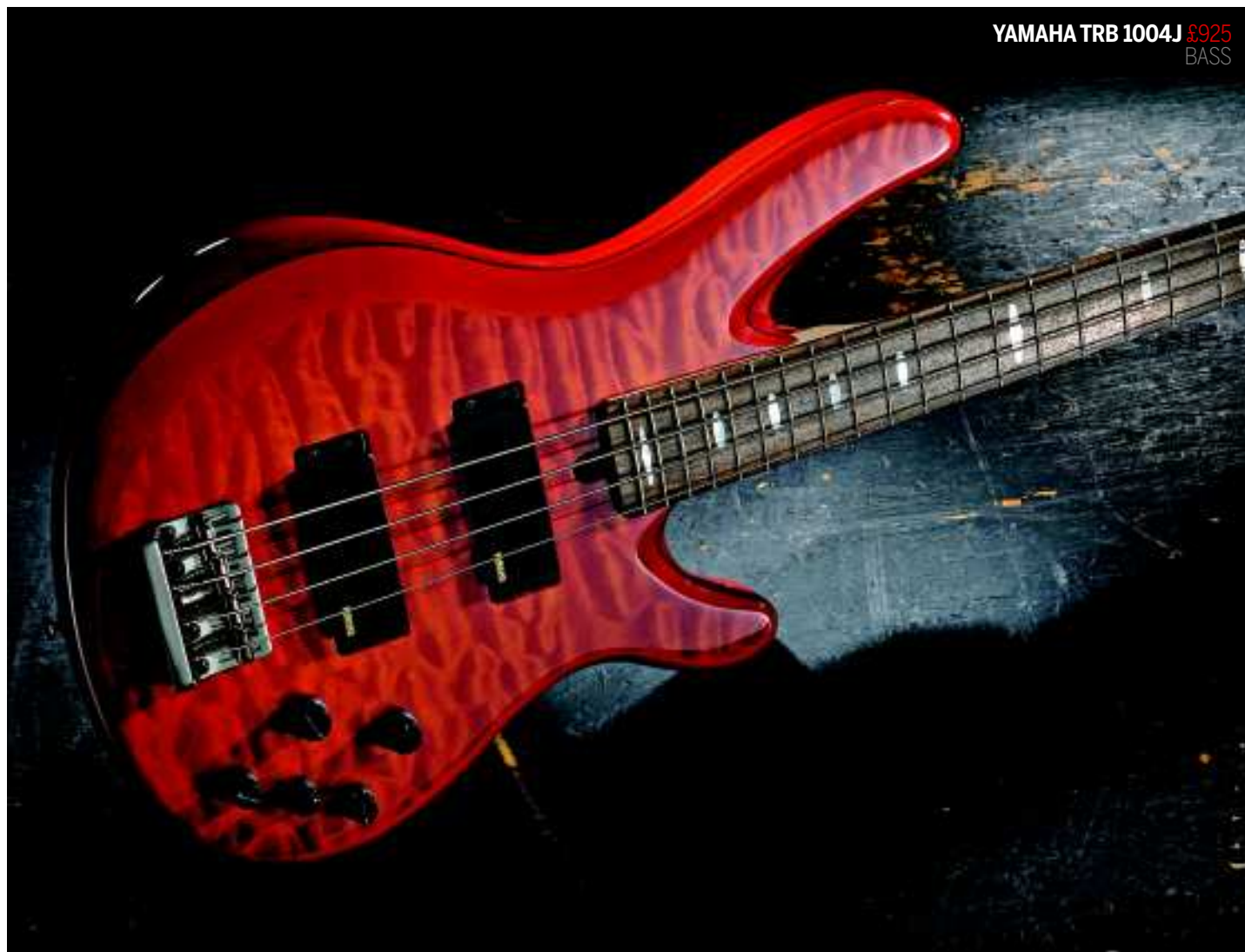
YAMAHA TRB 1004J £925 BASS