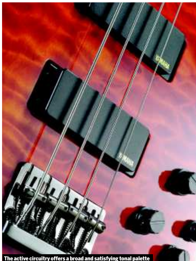
The active circuitry offers a broad and satisfying tonal palette

Its knock-out performance should tempt some old-school players to try the delights of the up-specced world