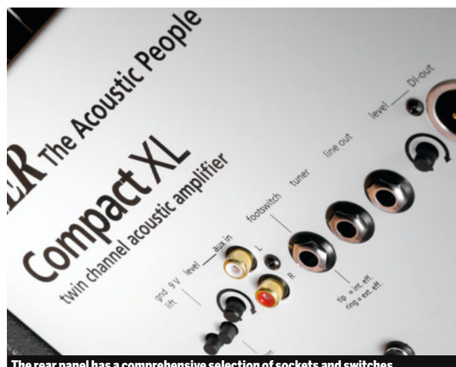
The rear panel has a comprehensive selection of sockets and switches

Features such as input one's 9V phantom power switch to power compatible instrument preamps connected via a stereo cable and, of course, the 48V phantom powered XLR mic input, give the Compact XL a thoroughly pro feel that's