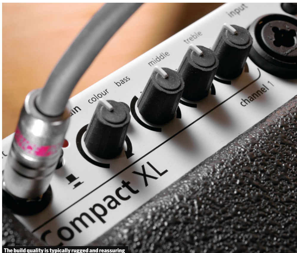
The build quality is typically rugged and reassuring