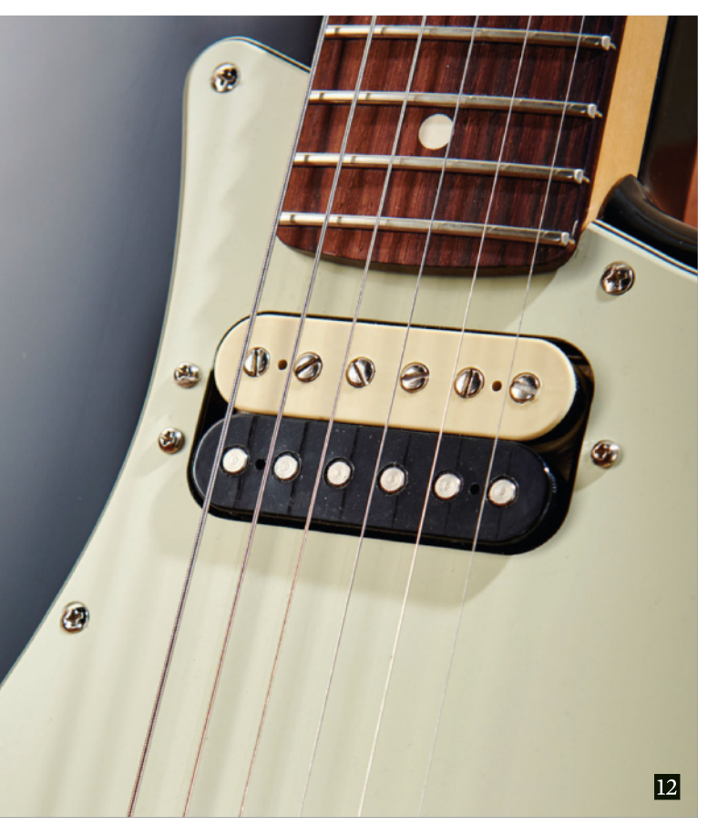
12. The Strat HH places a Shawbucker 1 in neck position and a slightly overwound Shawbucker 2 at the bridge

The first question is, are the Pros simply a rebranded Standard or an upgrade? For the everyman player, it's the latter. The colour/wood choices are wide and the subtle improvements to the build – on an already very well proven chassis - make a noticeable change, not least the new neck shape and the taller fretwire. Sonically, too, these Pros draw on plenty of classic character, especially the Shawbucker models: take the HH and compare it with the previous Standard, and you'll find a contrast in its clear and balanced new single coils. Yes, we've played thicker, beefiersounding Strats and Teles, and thinner, brighter ones, too, but as a foundation tone - which also includes a very smart and practical, lightweight moulded case - it all becomes a bit of a no-brainer. G