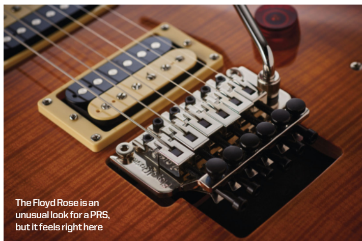
The Floyd Rose is an unusual look for a PRS, but it feels right here

Interacting with varying levels of dirt, the bridge humbucker can pull off anything from vintage AC/DC to scooped-mid thrash stuff. We like the clarity and note separation across all three locations on the pickup selector switch. Blues players will love the smooth attack and sustain of the neck position, and the single-coil tones on tap. This is a seriously versatile guitar.