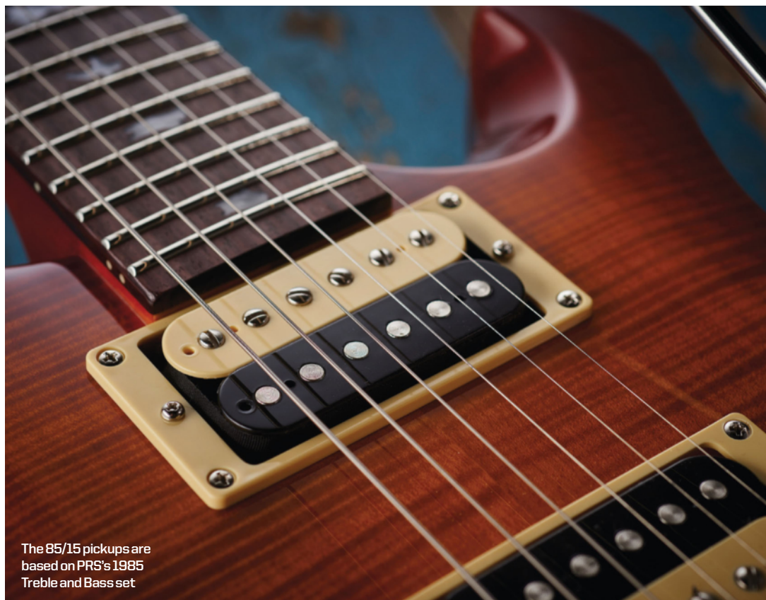
The 85/15 pickups are based on PRS's 1985 Treble and Bass set

While many associate PRS guitars with blues-rock cats such as Carlos Santana, card-carrying members of the metal brigade including Mark Tremonti, Chris Robertson of Black Stone Cherry and Periphery's Mark Holcomb are all in PRS's signature artists, too. With that in mind, it makes sense that the new Custom 24 'Floyd' has been voiced with heavy in mind, and the 85/15 pickups have less lower-mids than regular PRS humbuckers, and that means more clarity even when you get a bit crazy with the saturation.