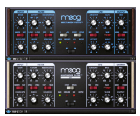
The standard and SE originals are included, mainly for legacy compatibility but also cos they still sound great

The LFO section is similarly impressive. Where once sat a single low frequency oscillator with phase offset, we now have two of them, working fully independently, their outputs mixed using the Balance knob. LFOs A and B are identical, running synced from 1/64 to 16/1, or unsynced from 0.01-50Hz in regular mode and 0.5-1000Hz in Hi mode, with Tap Tempo buttons on hand for manual timing. The upper range of Hi mode opens up the potential for all kinds of edgy pseudo-FM-style effects that can get