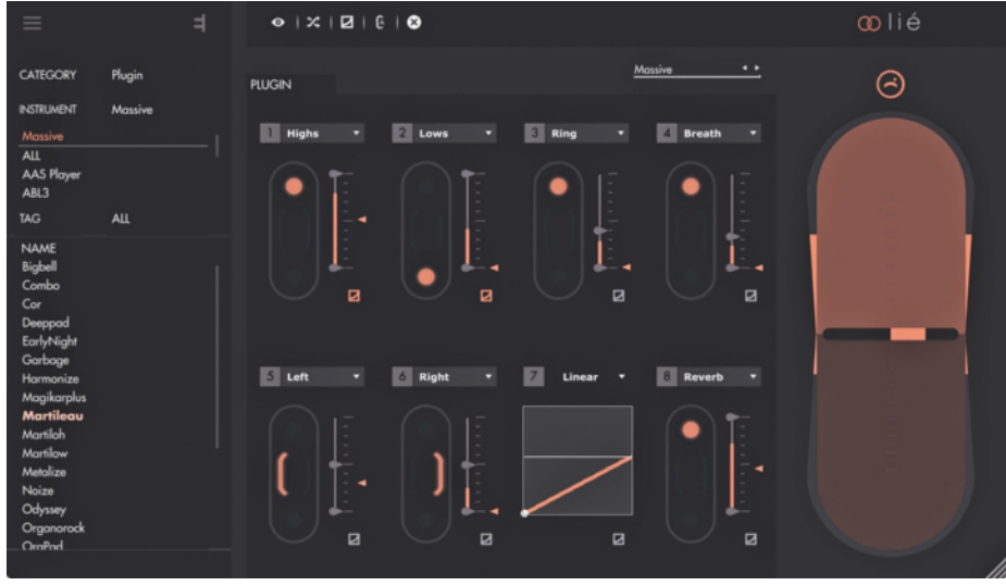
Minor browser issues aside, Lié is a commendably solid host and preset programmer/manager