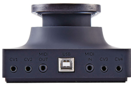
The back panel houses MIDI and CV connections

The idea is to tie meaningful sets of instrument parameters to the four axes for collective one-handed control. For example, modulate a synth's filter cutoff and resonance individually or together by assigning them to the top and bottom of the Skin, and couple them with, say, modwheel and vibrato depth on left and right. Assigning plugin parameters and