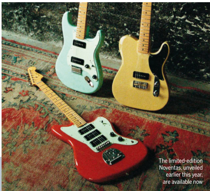
The limited-edition Noventas, unveiled earlier this year, are available now