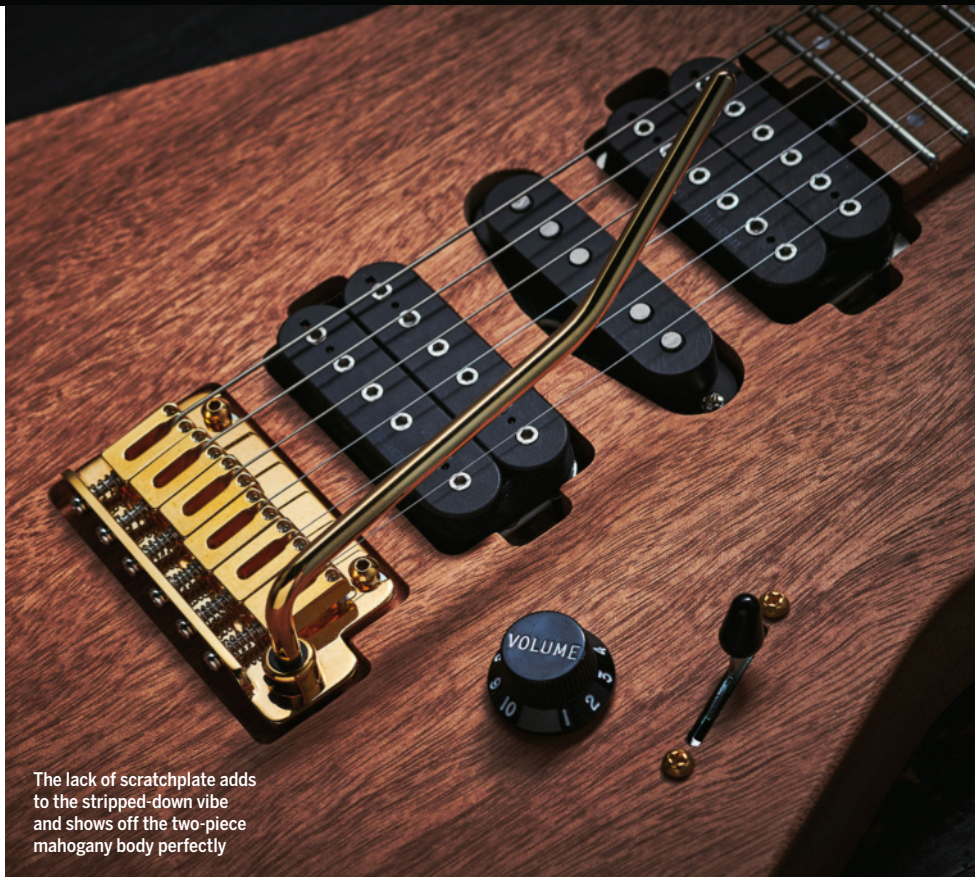
The lack of scratchplate adds to the stripped-down vibe and shows off the two-piece mahogany body perfectly

XL impregnated with PTFE for friction reduction. As set, it offers just under a tone up-bend on the top E and major 3rd on the G; the down-bend is generous, although if you really want to dump the strings it's less of what this is about. But for smooth Beck-style manoeuvres or beautiful Bigsby-like shimmers, it feels great and stays in tune.