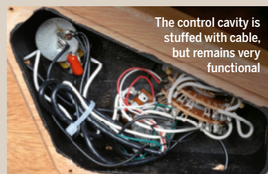
The control cavity is stuffed with cable, but remains very functional